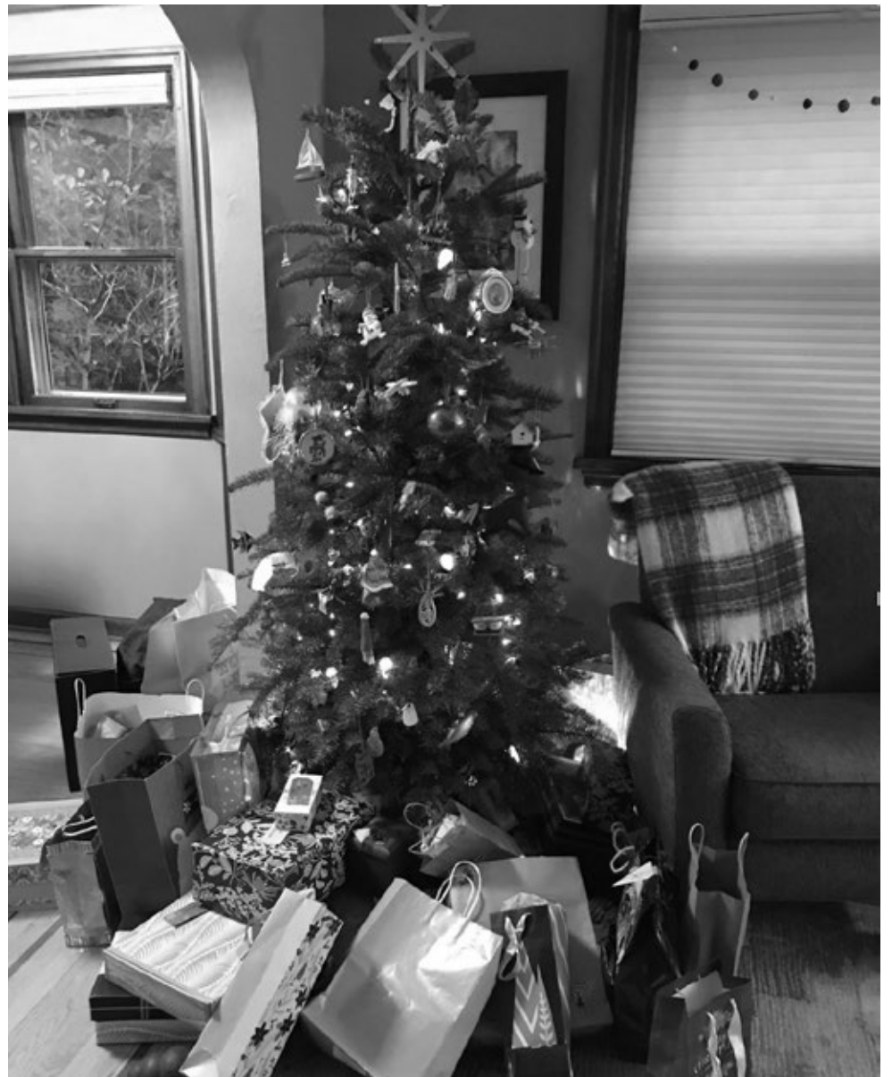
The fruits of my labor.