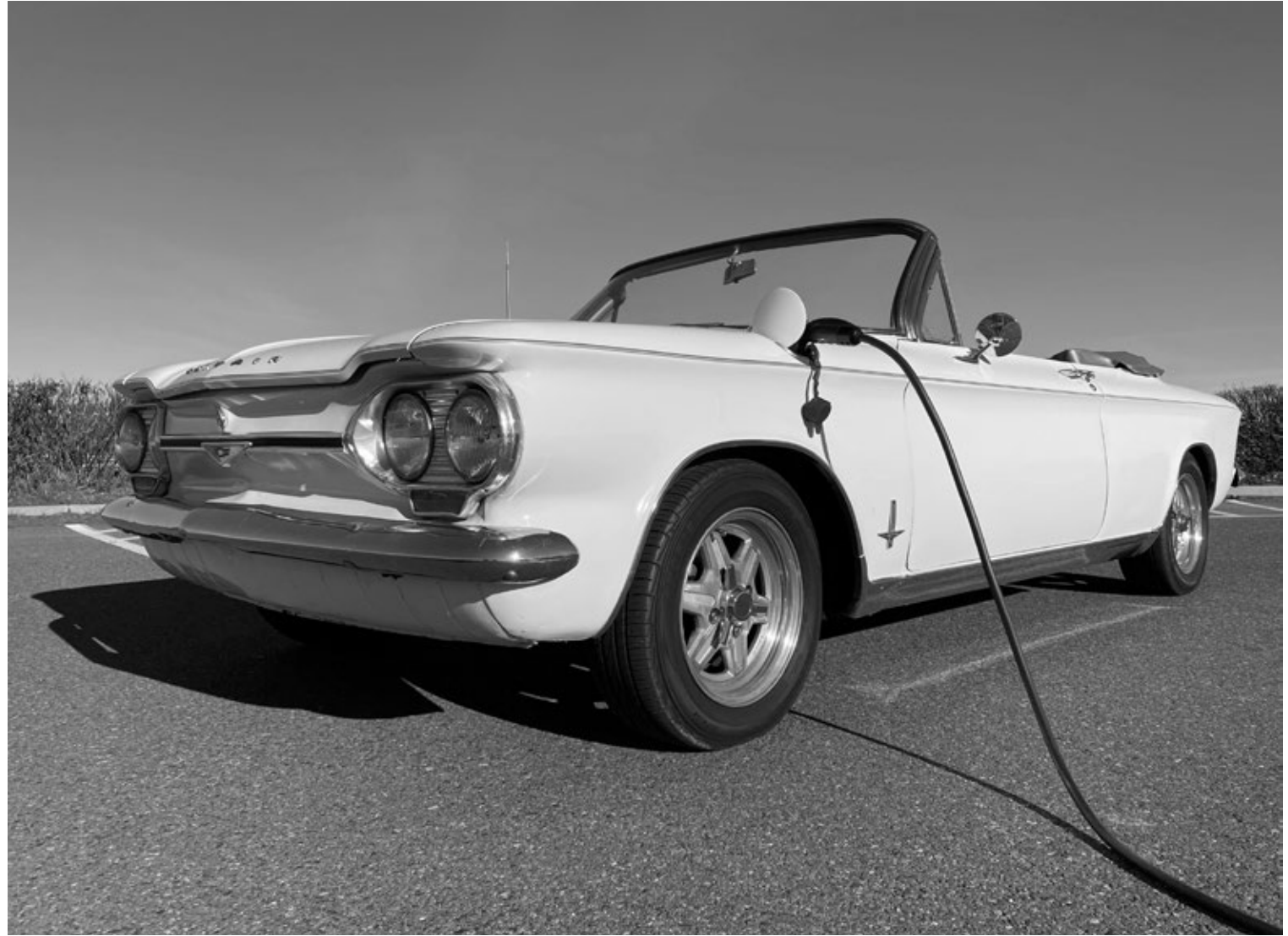
A 1964 Chevrolet Corvair that is now fully electric.

Through research, I learned that any gasoline car can become electric. Some cars are more conversion friendly, however. My Corvair was a fantastic candidate. The car has plenty of aftermarket support and getting parts is very