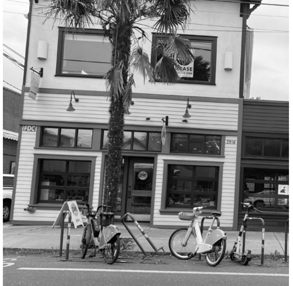
E-scooters and electric bikes are now a popular sight around Portland.

"This enjoyable excursion cost $1.00 to unlock and $0.37 per minute, a total of $10.55."