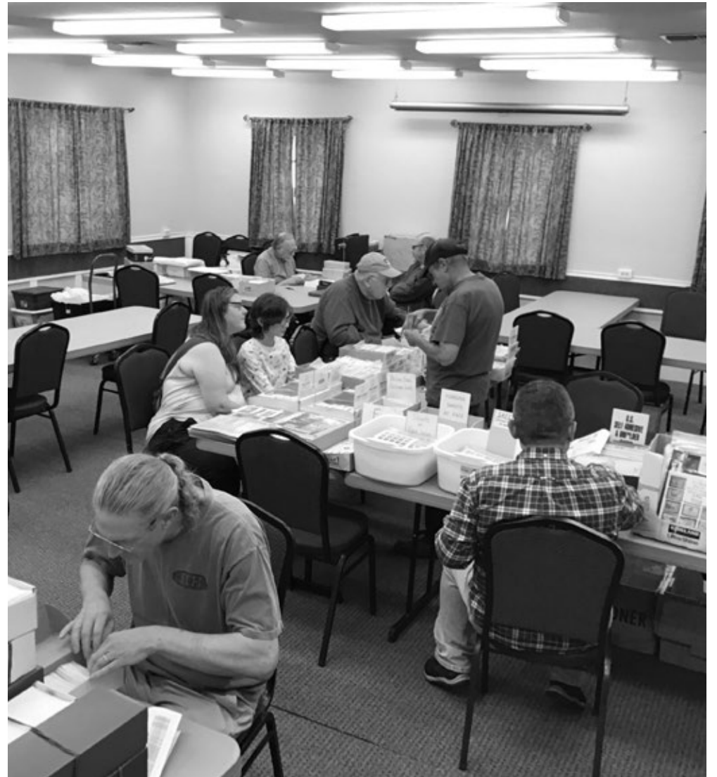
Stamp enthusiasts sort through treasures at Oregon Stamp Society's monthly Rose City Stamp Fair.