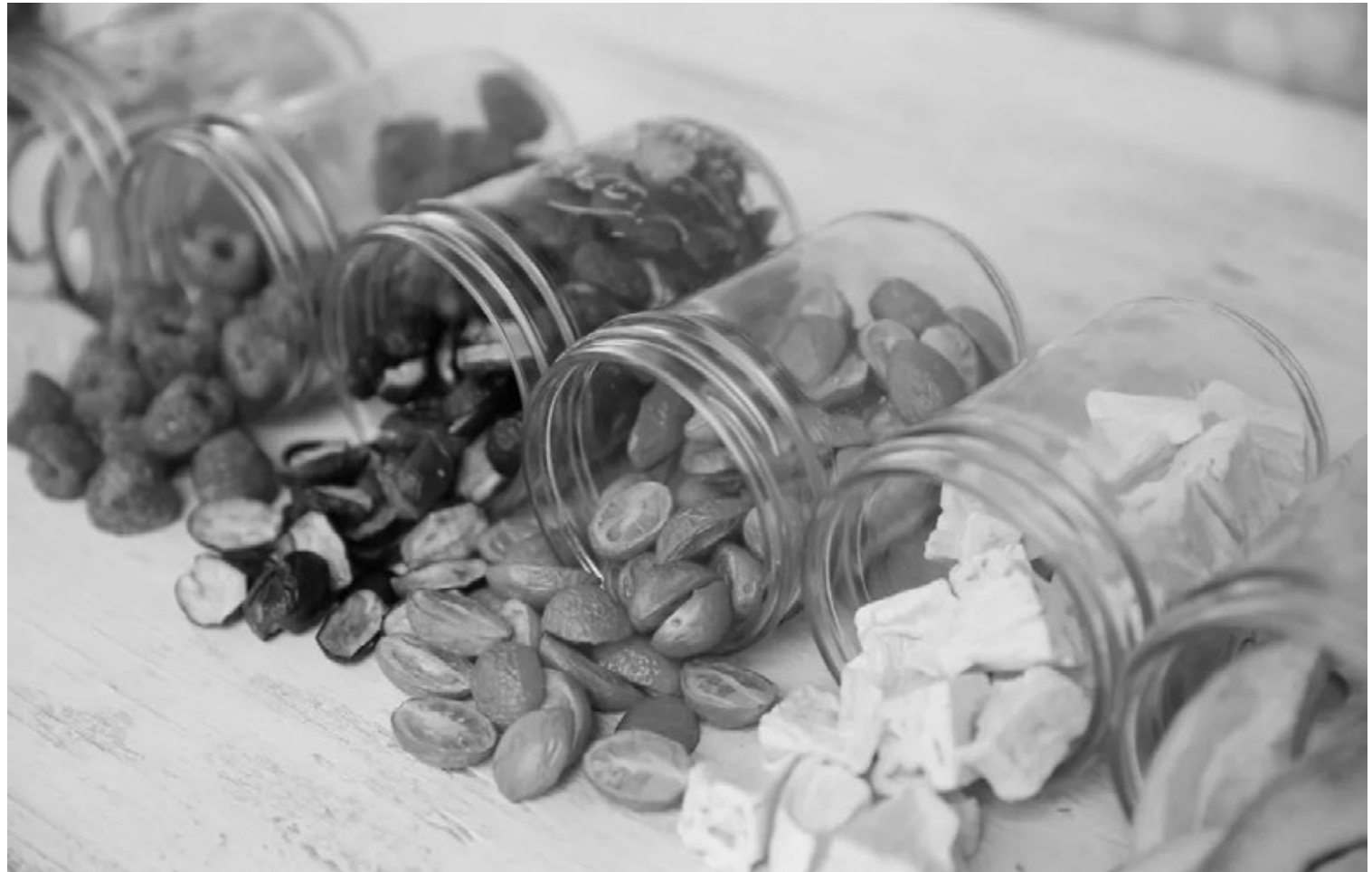
Fruits and vegetables can be dehydrated and stored for up to a year.

If you have a camp stove or even a generator, you may be able to prepare