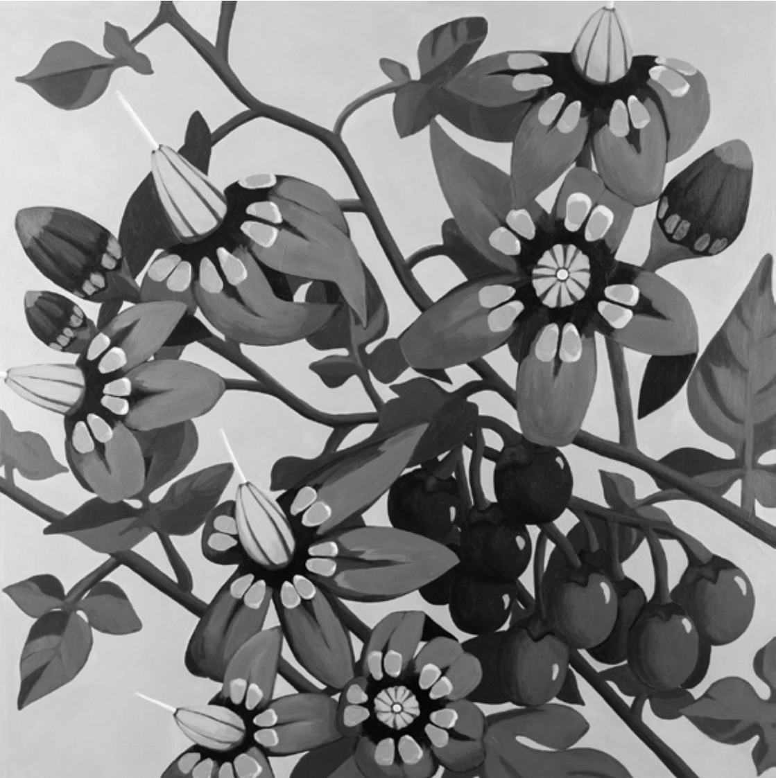
Amy Daileda’s ‘Bitter Nightshade’ is among the paintings she’ll be exhibiting this month at Flour Market.

For more information, visit Vivid-Element.com/art_event/micro-flora.