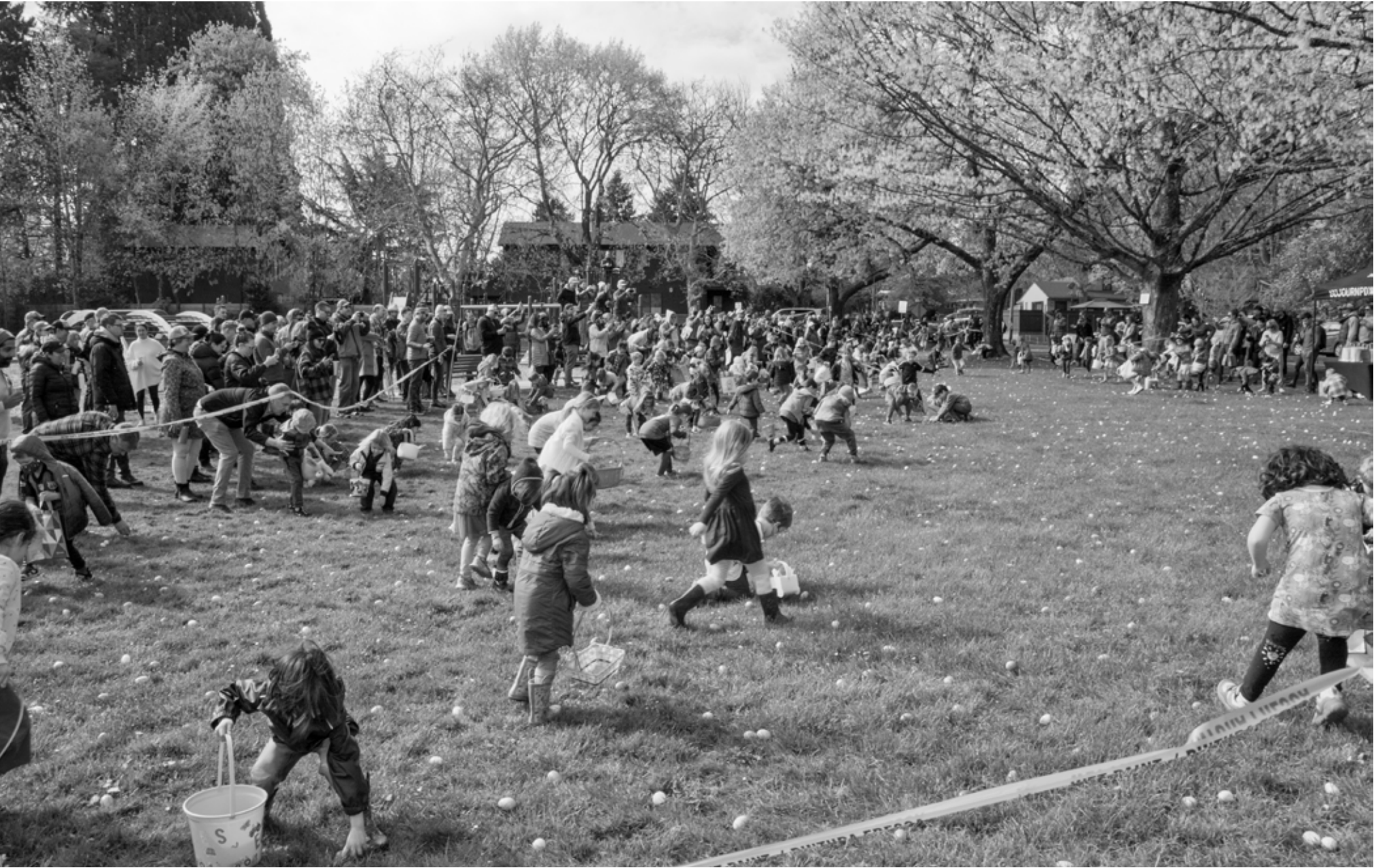
As the hunt begins, children rush onto the grass where numerous eggs had been left by volunteers.