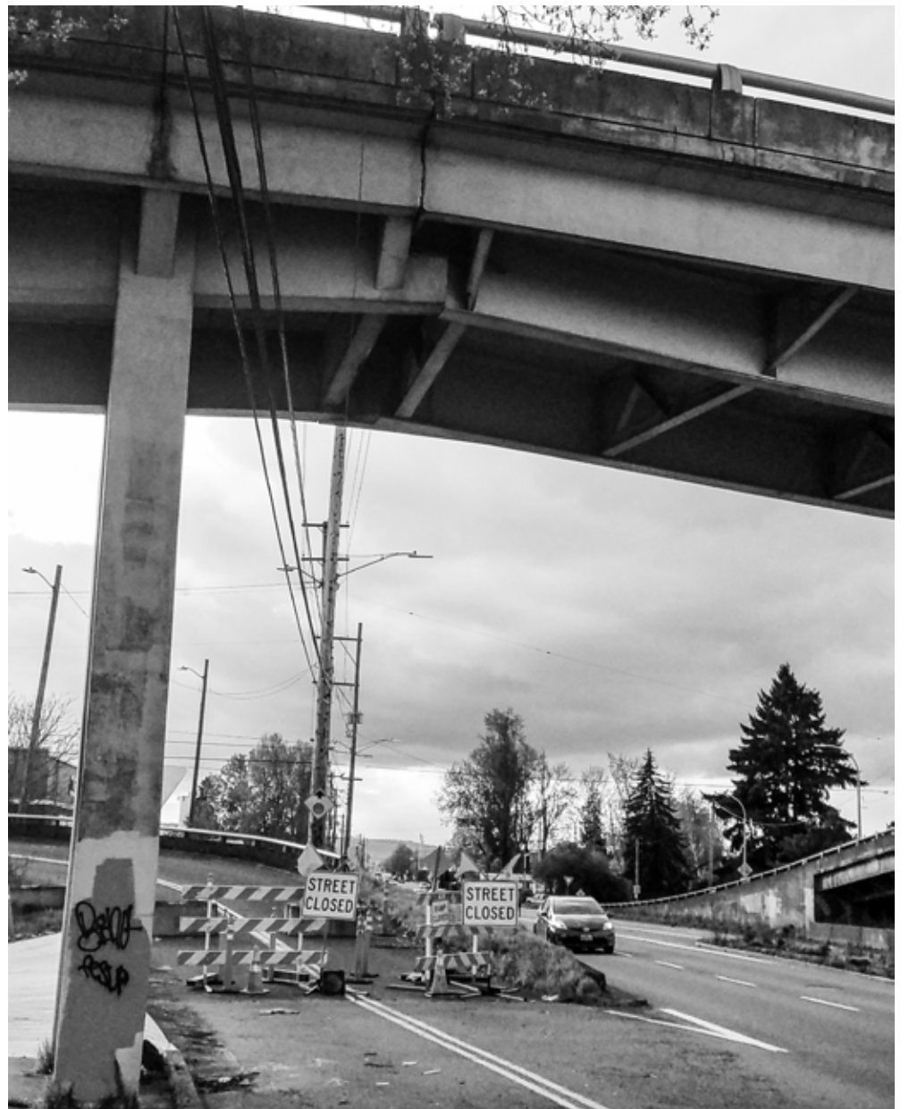
Bridge access closure signs stand on the Northeast 33rd Avenue access ramp to and from Northeast Columbia Boulevard.

PBOT inspectors found damage to concrete in one of the bridge's crossbeams at the northern terminus of the bridge. Two of the three ingress/egress lanes were closed in late August 2021. Only the undamaged northbound fly-over section,