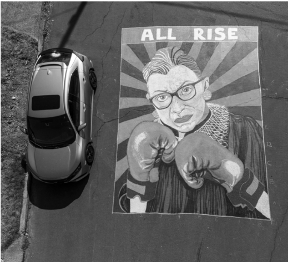
Neighbors in nearby Alameda in October painted a tribute to the late Justice Ruth Bader Ginsburg. The team effort was completed in just one long day.

That earned her a multitude of awards and achievements and placed her firmly in the Women’s Hall of Fame. A group of neighbors got together and, with the help of an artist, created a street mural to honor the late judge. With some pre-planning, the “All Rise” design was drawn in chalk and labeled to allow for everyone to jump in and paint. Together the work was completed in one long day. As the light waned, cars were positioned for their headlights to illuminate the intersection of Bryce Street and 27th Avenue to complete the mural. The justice is depicted wearing an earring with an image of the scales of justice, her favorite collar that came from Cape Town, South Africa, and boxing gloves ready to spar. “You know, the standard robe is made for a man because it has a place for the shirt to show, and the tie,” she once said. “So Sandra Day O’Connor and I thought it would be appropriate if we included as part of our robe something typical of a woman.” Street murals use special zone marking paint that will adhere to the